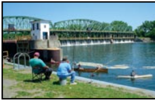
Fishing By Lock 8 in the Town of Rotterdam

Welcome to the Mohawk River/Erie Canal Blueway Trail. The Town of Glenville has partnered with the County of Schenectady and the New York State Department of State to showcase our 18 mile Blueway Trail that winds its way through our historic landscape.