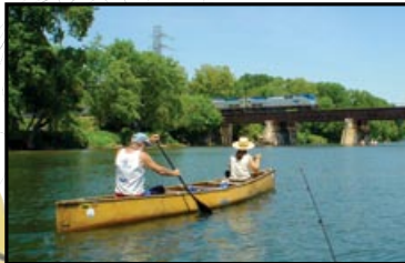
Paddling by train trestle bridge