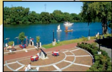
Boats along Riverside Park