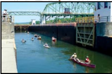
Lock 8 in the Town of Rotterdam