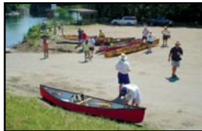
NYSDEC Freemans Bridge Fishing Access Launch

You can access the river at a number of public and private launches. Public boat launch sites can be found at Lock 7, Kiwanis Park and the NYSDEC Launch at Freemans Bridge Road. Canoe and kayak access is available at Lock 9, Train Station Park and Gateway Landing. For more information on other boat access sites go to the Blueway Trail Table of Sites in this brochure.