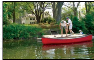
Dock side at River Stone Manor